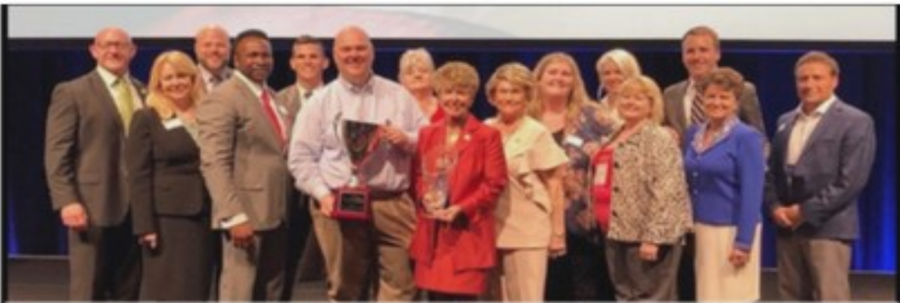
Tennessee- 2017 RPAC President's Cup honoree. Thank you RPAC investors!