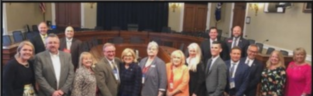
MTAR representatives met with U.S. Rep. Diane Black to discuss issues vital to property owners and real estate.