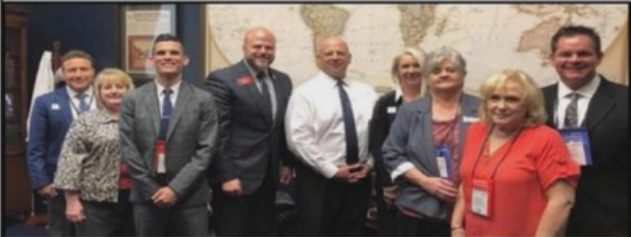
MTAR representatives meeting with U.S. Rep. Scott DesJarlais in D.C.

Last week, several MTAR staff and realtors visited Capitol Hill in D.C. to discuss the importance of net neutrality, tax policies that benefit property owners, the renewal of the National Flood Insurance Program (NFIP), and access to fair and affordable housing for all. MTAR RPAC and Government Affairs Committees advocate for our realtor family. We let our policy makers know that home ownership isn't a special interest, it's a common interest!